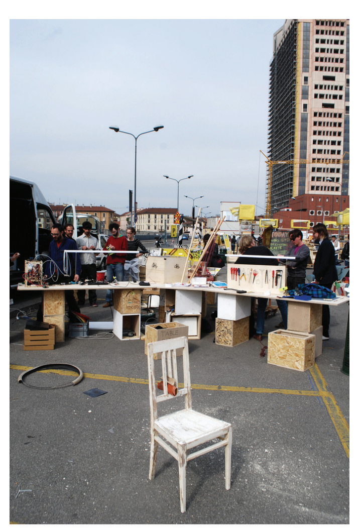
MakerLab:Milan 2011 - Press Review